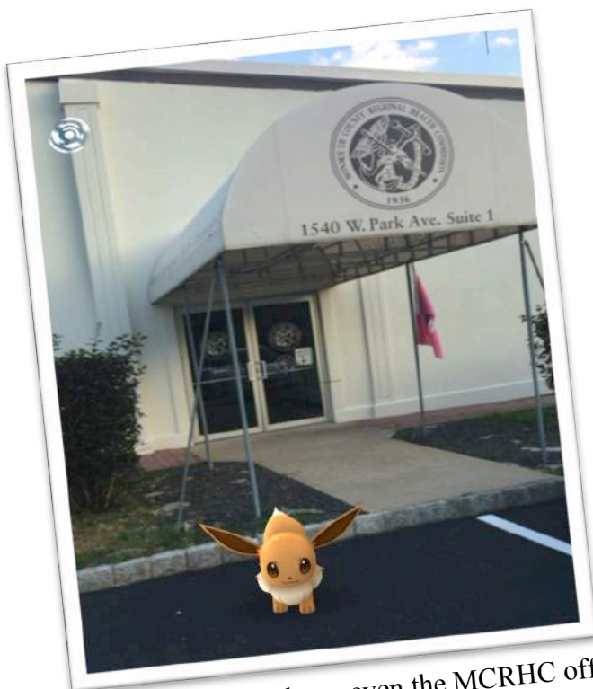
Pokemon are everywhere, even the MCRHC office!

Monmouth County is having a hot summer, and it's easy to get dehydrated while walking around in the sun. Drink plenty of water and consider bringing a water bottle along on your adventure.